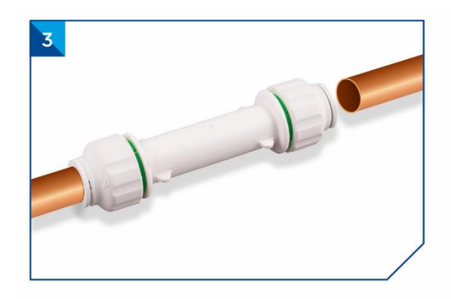
Connect the slip port with the pipe first and slide it until the connection is adjusted with the opposite side.