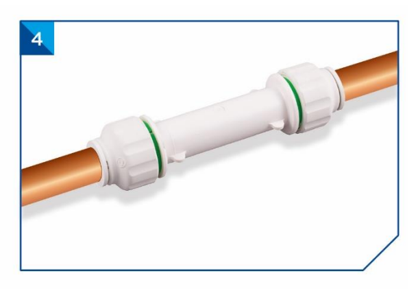
Connect to the other pipe and arrange the connection position.

For further Twistloc product information please visit: